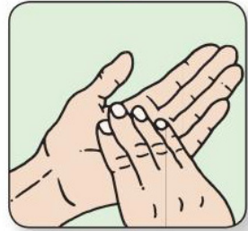
6. Rotational rubbing, backwards and forwards with clasped fingers of hand in left palm then vice versa.