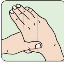
5. Rotational rubbing of right thumb clasped in left palm, then vice versa.