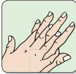
2. Right palm over left dorsum and left palm over right dorsum.