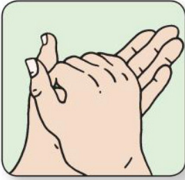
1. Palm to palm.