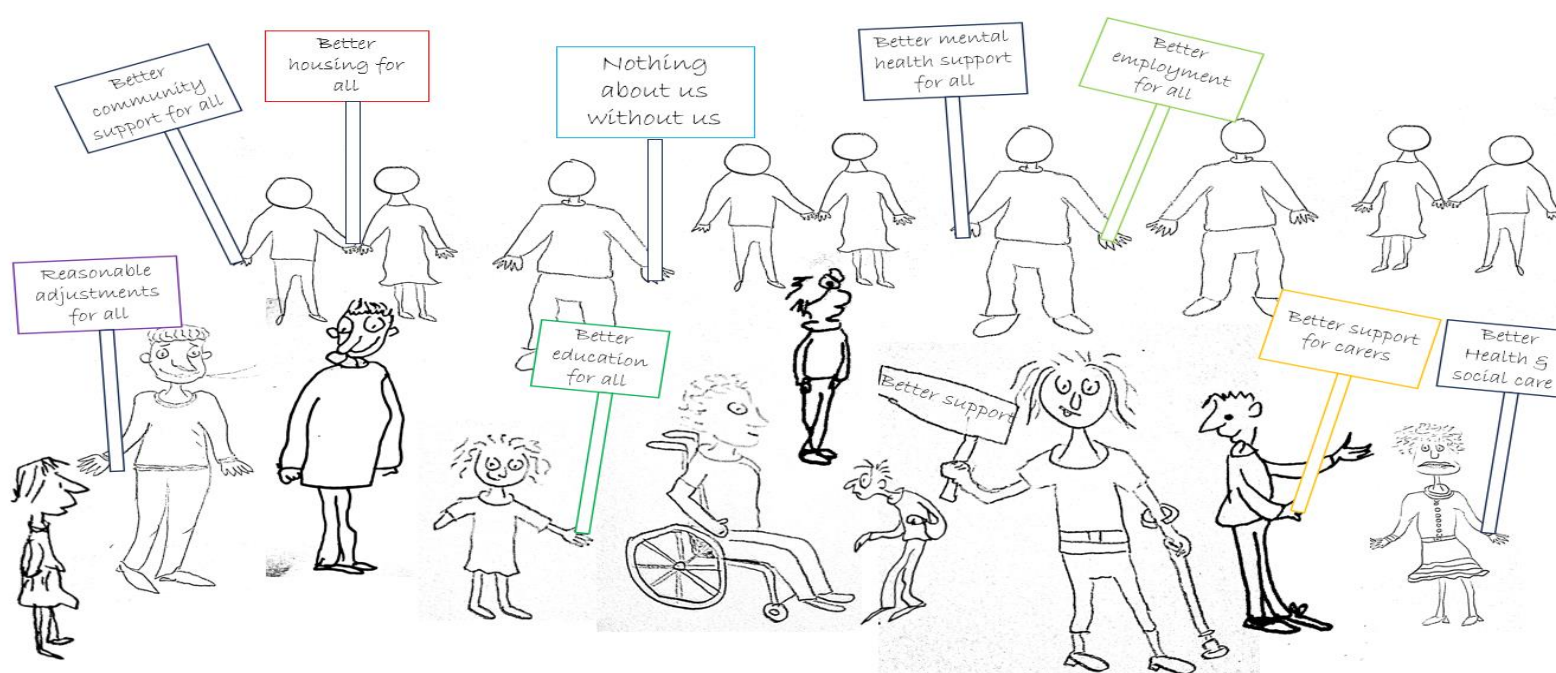
Image: A group of people with signs calling for better support for the disabled community. By Cheryl Stafford – Adult