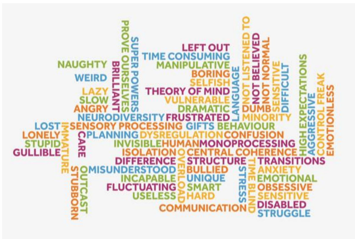
Graphic: Amber Miller

The words autistic individuals associate with autism. (Difference, overload, transitions, frustrated, misunderstood, time blind, theory of mind, outcast, human, communication, neurodiversity, brilliant, incapable, care, anxiety, minority, stress, invisible, isolation, confusion, slow, angry, behaviour, language, bullied, sensory processing, unique, emotional, gifts, dysregulation, central coherence, structure, monoperceiving, vulnerable, planning, fluctuating, immature, dramatic, aggressive, sensitive, control freak, weird, prove ourselves, not normal, not listened to, not believed, lost, useless, lonely, hard, emotionless, difficult, naughty, stubborn, lazy, left out, time consuming, manipulative, boring, selfish, gullible, super powers, stupid, obsessive, sensitive, disabled, struggle, smart, struggle, dumb, vulnerable, high expectations.)