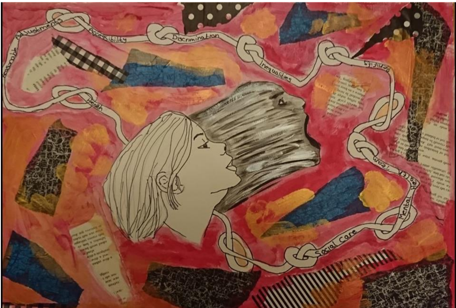
Artwork Cherl Stafford

The COVID-19 pandemic and previous pressure on the NHS have had a profound impact on various aspects of healthcare services, including those for individuals with autism. As a result, several challenges have emerged, contributing to a notable shift in the landscape of autism support and diagnosis. Some of the key impacts include: