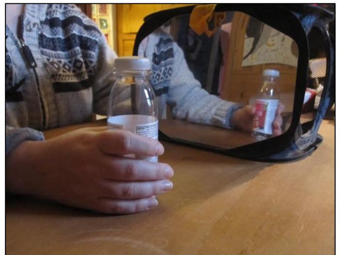
Mirror Box Therapy